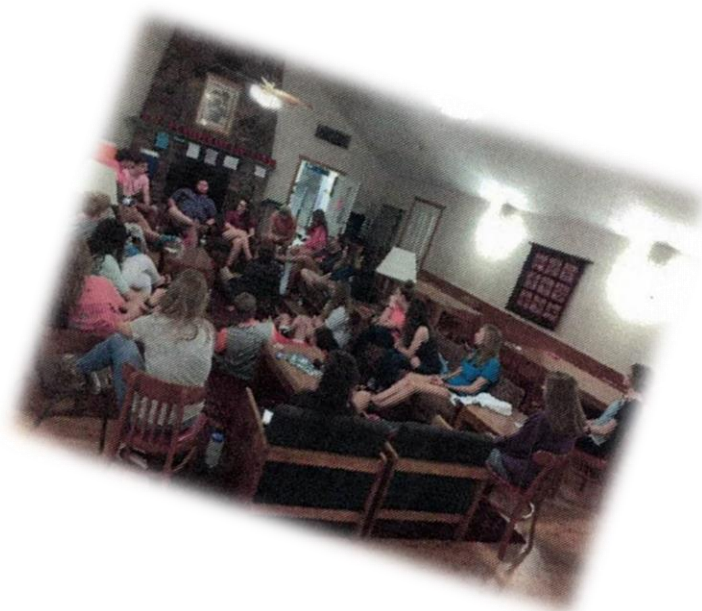
"Back Home Group" Discussion Time