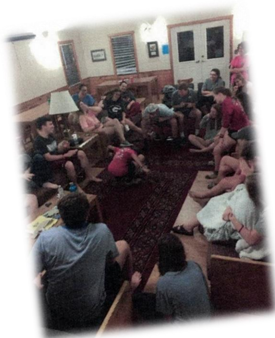
"The Box Game" - Recreation